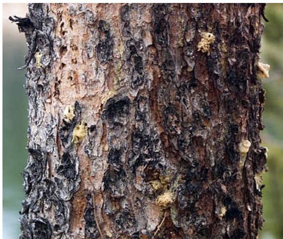
Mountain Pine Beetle Infested Tree Trunk

Across Canada, UNBC is an environmental leader. According to the most recent data from Statistics Canada, the proportion of students in environmental programs at UNBC is about 20-times the national average.