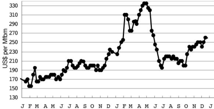
WSPF 2x4 PET KD Studs 2009 - 2011